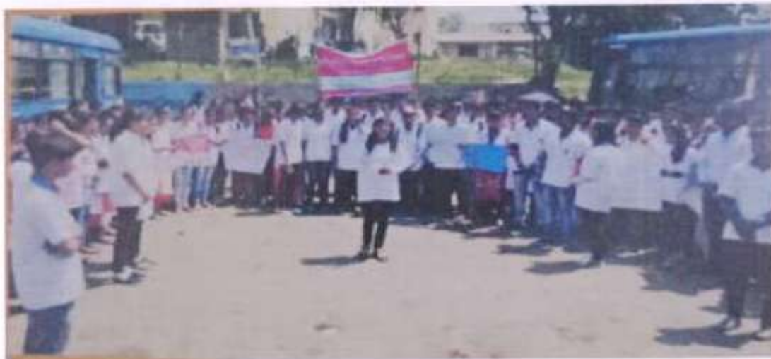
Right of vot