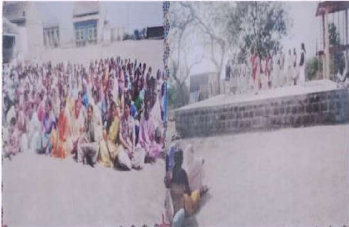
Health and hygiene Guidance For Female: Street play