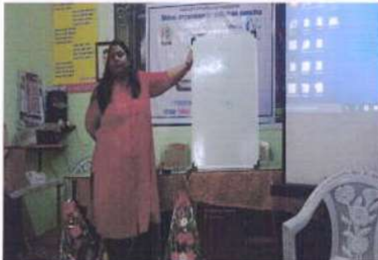
Mental Health Awareness program

Students actively participated in the lecture and learnt a lot through hands-on learning. Stress Management about Mental Health Awareness program on organized a highly effective program in collaboration with Shivsanjivani Social Foundation.