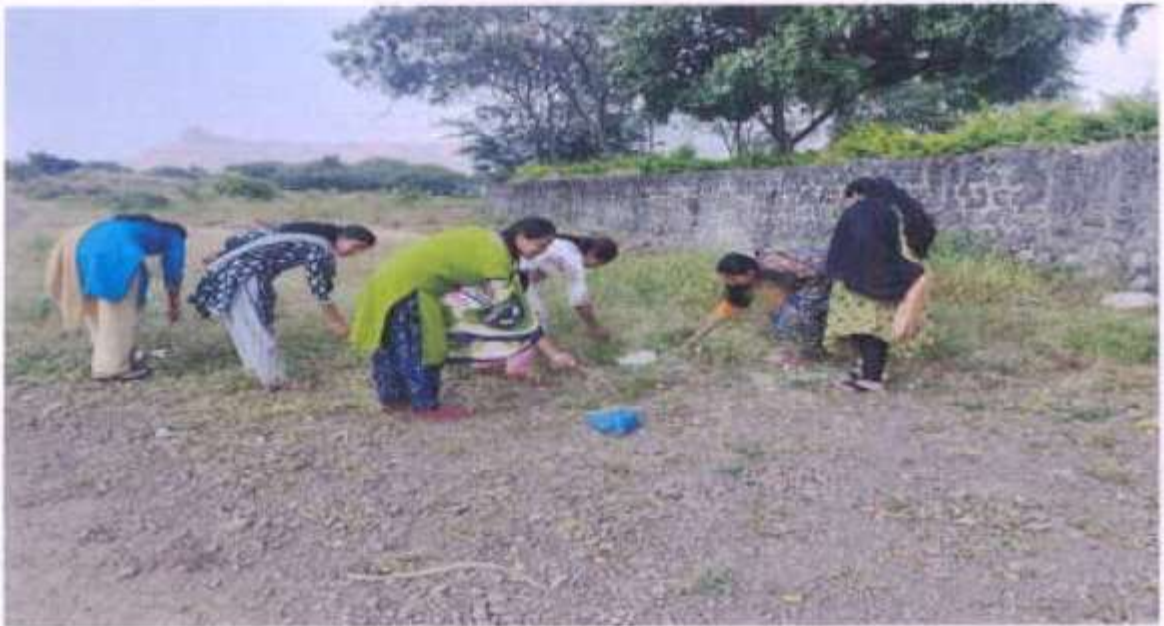
Cleanliness Campaign at Kaplidraswer temple