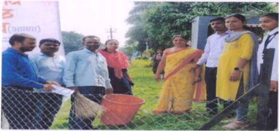
Cleanliness Program ,Dumberwadi