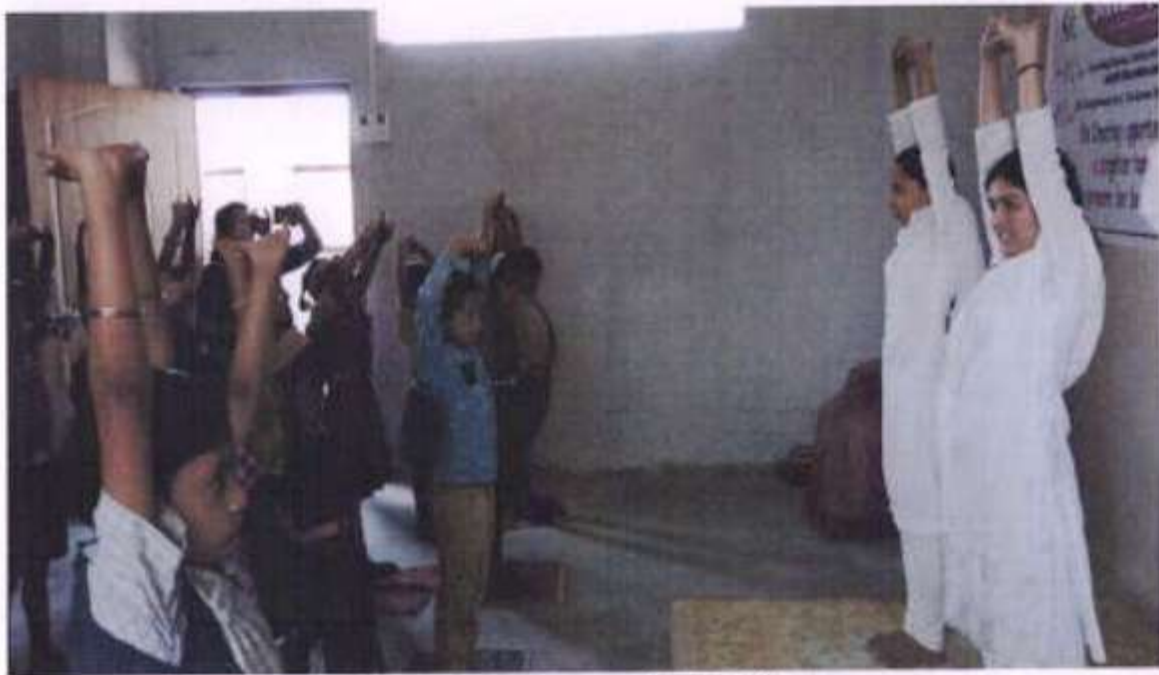
Yoga with Primary School Children