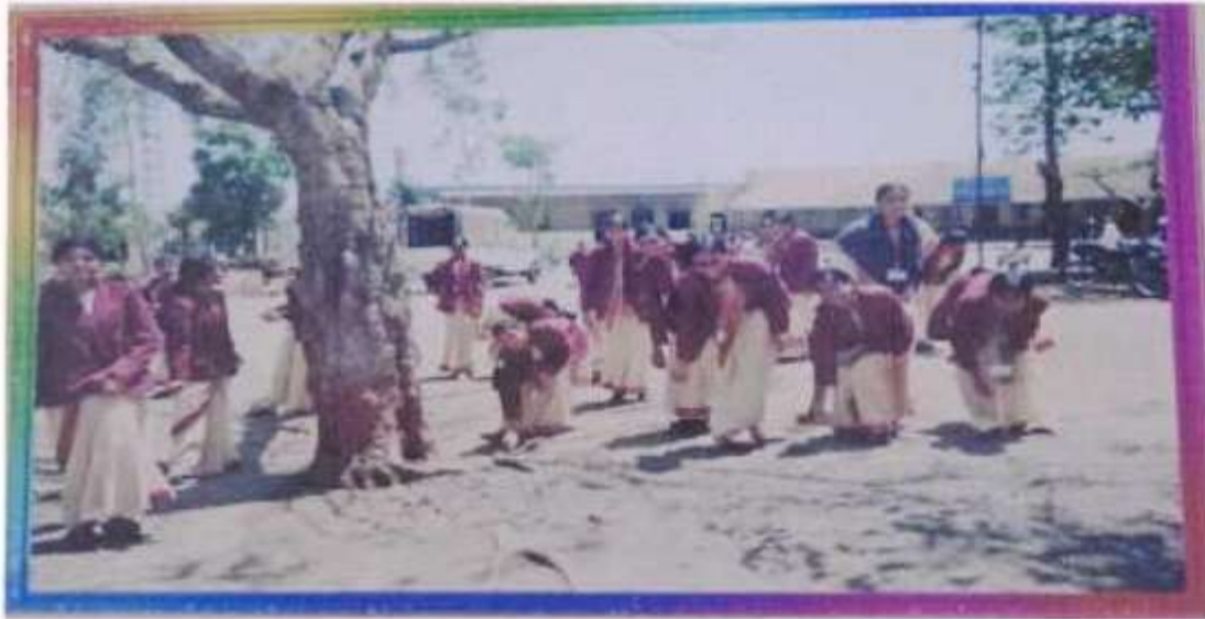
Gram Swachhata Campaign at Dumberwadi, Otur