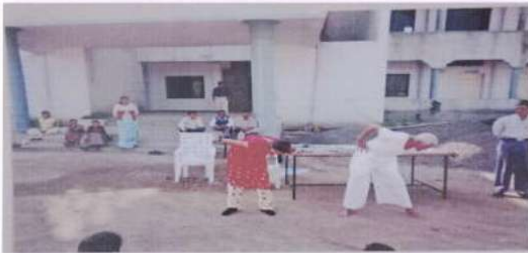
International yoga Day Celebration in Dumberwadi