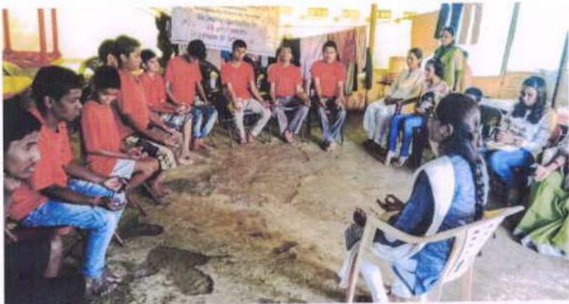
Visit to Special Children Institute