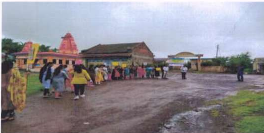
AIDS awareness Rally