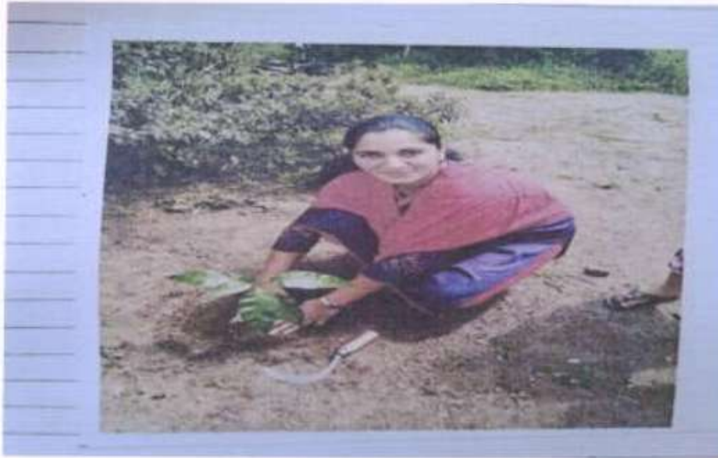
Tree Plantation Activity at Home During Lokdown