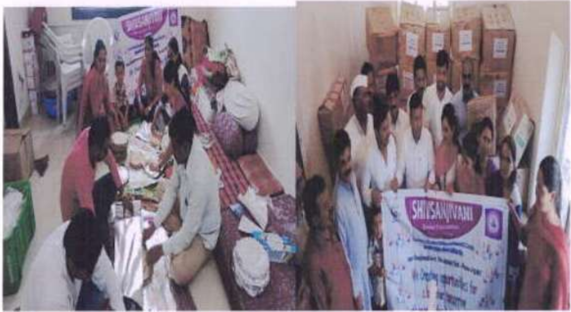
Flood relief Campaign for Kolhapur flood victim