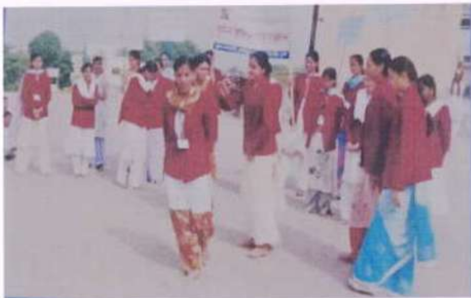
RashtriyaEktaDiwas Street Play