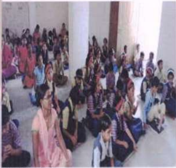
Teaching Tribal Students