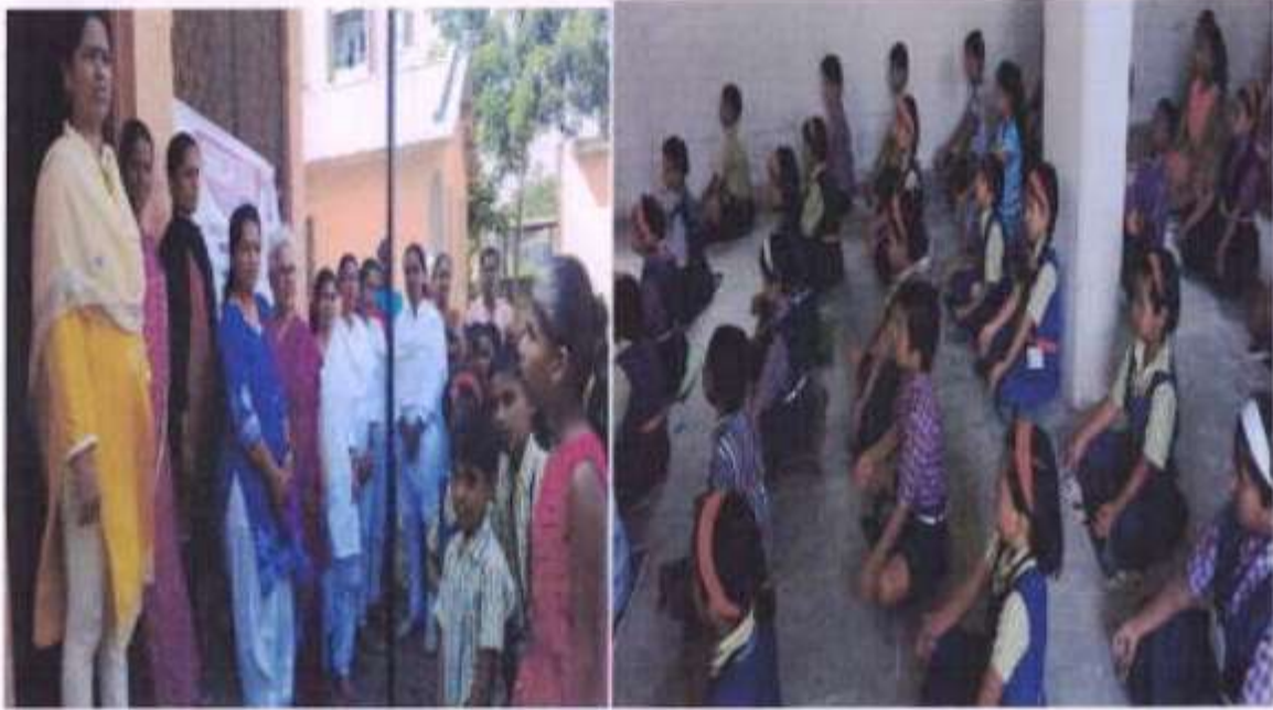
Yoga with Dumberwadi Primary School Children